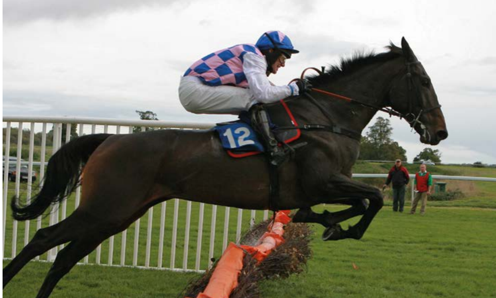
Alverstone winning at Chepstow