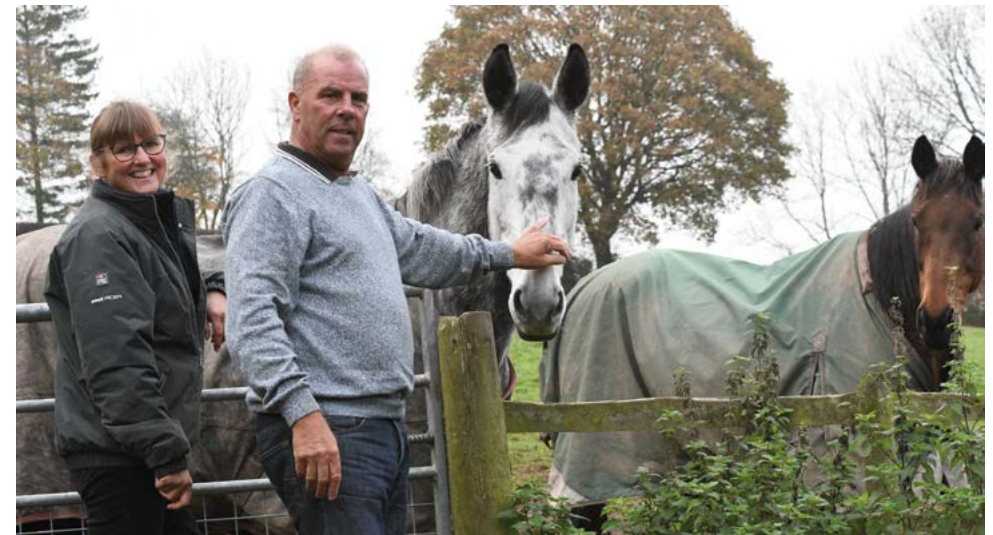
Wychwoods Legend pictured right