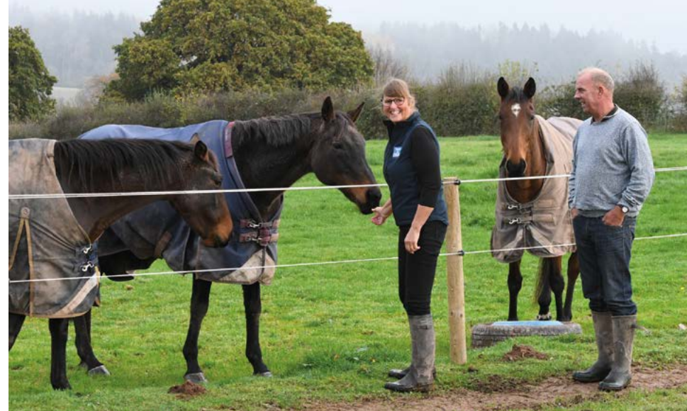
It's A Discovery pictured centre