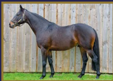
MIDNIGHTS LEGACY Midnight Legend x Giving