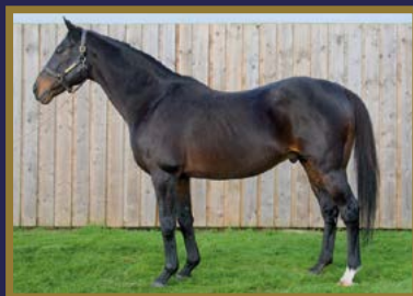
DINK Poliglote x Napeta

Alne Park Stud, Park Lane, Great Alne, Warwickshire, B49 6HS. 07464 633938 info@alneparkstud.com www.alneparkstud.com Follow us @alneparkstud