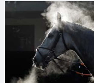
Front cover