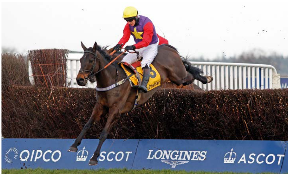
Dashel Drasher wins the Betfair Ascot Chase

received the same honour – a stunning double for a smaller operation competing against more commercial farms who receive far more mares.