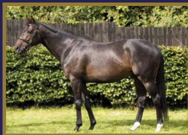
OCOVANGO Monsun x Crystal Maze