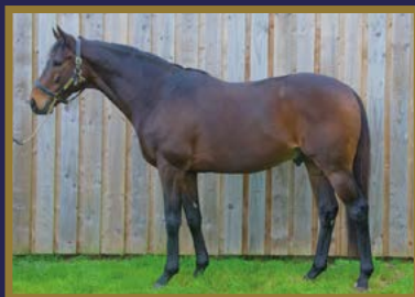
SUBJECTIVIST Teofilo x Reckoning

As well as our own band of broodmares, we offer excellent facilities for boarding mares, foaling and breaking.