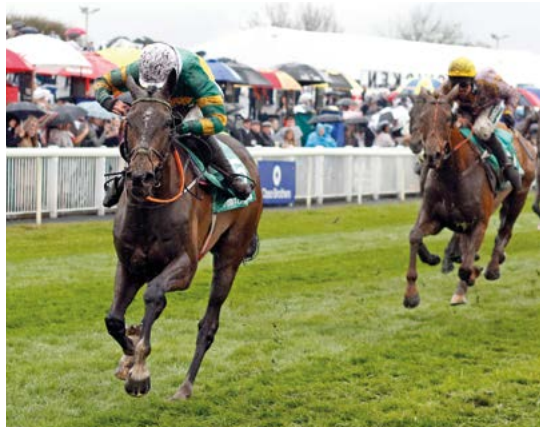
Inthepocket winning the Top Novices' Hurdle at Aintree