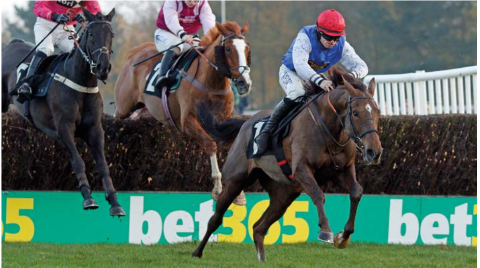
Chilli Filli – winner of the Bud Booth Mares' Chase at Market Rasen in November 2021