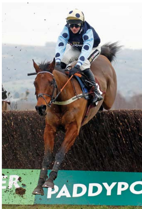
Edwardstone