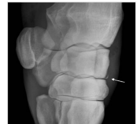
Figure 4: An example of a displaced small chip fracture of the distal radial carpal bone. This is the commonest site for chip fragmentation in the knee as a result of the force-concentration peaking in this site

Treatment is usually by surgical removal of the fragment itself and smoothing off of the fracture fragment 'bed'. Once this has been carried out the joint cartilage will