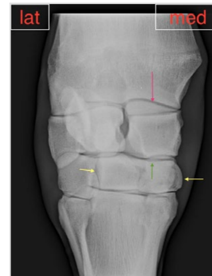
Figure 2: Dorsopalmar view of the right knee of a racehorse. The most important weight-bearing structures, and therefore the seat of most of our problems, are the radial carpal bone (red arrow) and the third carpal bone (yellow arrow). Because most of the weight is borne down through the medial aspect of the limb, the 'cup' in which the radial carpal bone sits (the radial facet) bears enormous loads (green arrow)

These early changes if not taken seriously can lead to lifelong degenerative joint disease (arthritis), and we therefore have to pay attention when the horse is telling us that the knee is having trouble. In horses with very poor carpal conformation (fig 3) even normal training loads and a very slow progression in training speeds can produce carpitis simply because the conformation