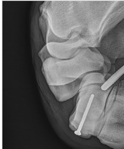
Figure 5b: The same bone seen in figure 5a following surgical fixation of the slab fracture with a carefully placed screw

These fractures can run in two or three different directions but the most common are the sagittal fracture, where the bone simply splits in two, or the