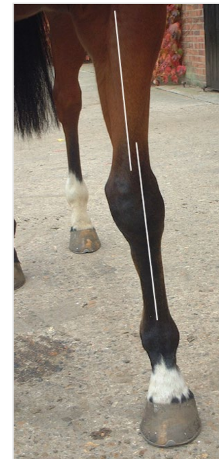
Figure 3: An example of poor knee conformation, enough to challenge the ligaments and bones comprising the knee. Here the knee is 'offset', in that the middle of the cannon bone is situated to the side of the middle of the forearm (white lines). This places exaggerated loading on some of the small bones within the carpus

This doesn't imply that the horse is fatigued, rather that the material properties of the structure (in this case bone) have become fatigued after repeated sub-maximal loading. Metal fatigue in aircraft