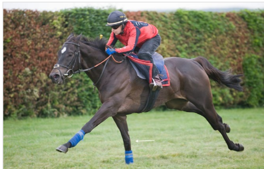
Figure 1: A horse galloping at speed, with its entire weight being borne on the right fore leg. Notice how the extreme forces push the knee slightly backwards (white arrow). The leg is prevented from collapsing completely by support from the palmar carpal ligament, a thick 'strap' running from the back of the forearm to the top of the cannon bone

These tiny bones are wrapped in incredibly dense connective tissue, forming