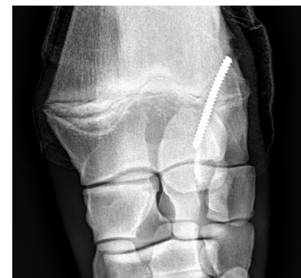
Figure 3 A pre-operative radiograph of a bandaged knee where the transphyseal screw head has broken off during the attempted standing screw removal. This will be removed under general anaesthesia with a broken screw kit

Serial evaluation is essential both pre- and post-operatively to ensure surgery is the correct option and that we reach the correct angulation once the screw is placed; if the screw is left in place longer than is needed, overcorrection can occur. Post-operative bandaging and stall rest for between two and three weeks is desired. The screw is removed typically standing with sedation and local anaesthetic. Screws can snap as the implant is removed; this has no long-term effect but in the short term will require an anaesthetic and special equipment for removal.