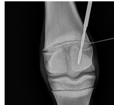
Figure 2 Intra-operative radiograph during placement of a lateral 4.5mm screw for treatment of a fetlock varus angular limb deformity. The drill bit is across the lateral aspect of the distal cannon bone growth plate

Transphyseal screws are more commonly performed and favoured out of the corrective surgical options to treat fetlock and carpal varus. Baker et al. showed yearlings treated for carpal varus with this procedure compete as well as their siblings that were not diagnosed with this angular limb deviation. The surgical procedure is performed under a brief anaesthetic with a small incision, on the outside of the limb for a knee or fetlock varus, and a screw is inserted across the growth plate to retard growth on that side.