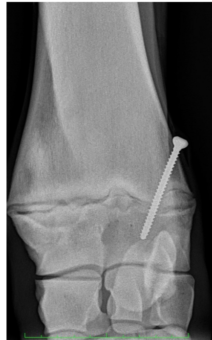
Figure 1 A dorso-palmar radiograph of the knee illustrating a transphyseal screw placed across the lateral aspect of the distal radial growth plate to retard growth, to treat a carpal varus angular limb deformity

Data sets in small groups of foals indicate that periosteal strips have no effect on growth, so this is less commonly performed currently. However, there may be a place for this in foal carpal valgus. The procedure is performed under a quick general anaesthesia, via a small incision on the outside of the limb for a carpal valgus and the periosteum is elevated to speed up growth on this side. Recovery is fast from this procedure.