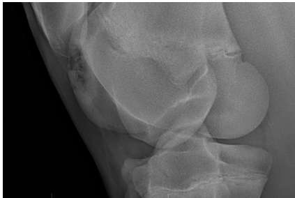
Figure 6 An oblique radiograph of the stifle highlighting the femoral lateral trochlear ridge with a large sized OC lesion present; this is likely to become clinical if not treated arthroscopically and the size could limit athletic potential