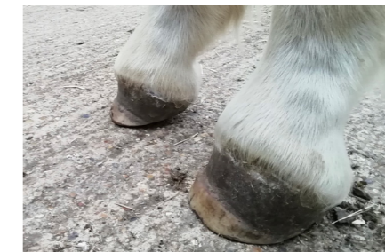
Figure 4 A foal presenting for an inferior check ligament desmotomy bilaterally in front for contracture in both coffin joints; worse contracture present in the right front (the farthest away limb)

Diagnosis typically occurs between one and six months of age and is made via thorough routine assessments on solid ground where angulation of the foot can be seen. Conservative management consists of correcting the nutritional plane, ensuring appropriate calorie intake and assessing balance of minerals. If still on the mare, weaning early or decreasing the mare's concentrates may be required. Pain relief and exercise to control any painful stimuli can be helpful. Farriery is important, especially in flexural deformities in the coffin joint region where rasping the heels over time can help treat contracture.