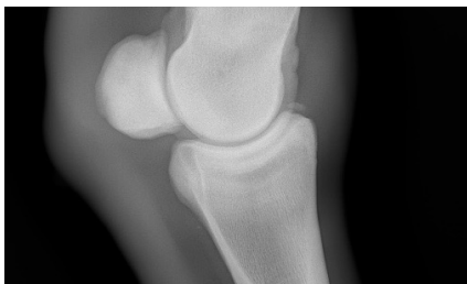
Figure 7 A latero-medial radiograph of a fetlock with a moderate sized osteochondral fragment off the dorsoproximal aspect of P1

Yearlings are screened and decisions are made as to whether to remove the fragments with the stud manager, farm veterinarian and surgeon. Recently a surgery has been developed to pin cartilage flaps back down on the lateral trochlear ridge of the stifle. This surgery works before the cartilage ossifies. This is an arthroscopic procedure where absorbable darts/pins are placed through the cartilage flap securing it to the subchondral bed with the aim of resolving or decreasing the size of the lesion as the weanling grows. This would require earlier radiographic screening to assess whether that weanling would benefit from this surgery.