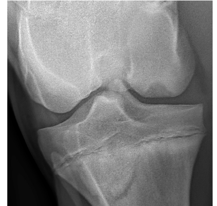
Figure 9 A caudo-cranial stifle radiograph depicting a large medial femoral condyle subchondral bone cyst which was then treated with an interference absorbable screw

in animals treated under three years old; however, size, location, pre-existing joint pathology and clinical signs will also play a role in success.